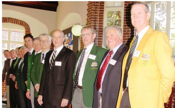
Shore's Olympians at the Legends Lunch on 4 May.